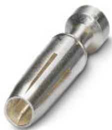
Turned 2.5 crimp contact, individual female contact, core diameter 2.5 mm 2 , silver-plated

Please be informed that the data shown in this PDF Document is generated from our Online Catalog. Please find the complete data in the user's documentation. Our General Terms of Use for Downloads are valid ( http://phoenixcontact.com/download )