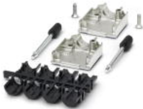
POWER-SUBCON cable housing, 3-pos.

Please be informed that the data shown in this PDF Document is generated from our Online Catalog. Please find the complete data in the user's documentation. Our General Terms of Use for Downloads are valid ( http://phoenixcontact.com/download )