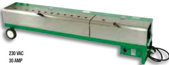
230 VAC 30 AMP