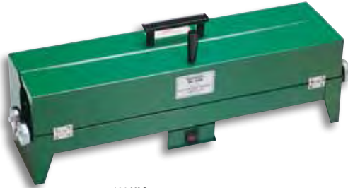
120 VAC 20 AMP