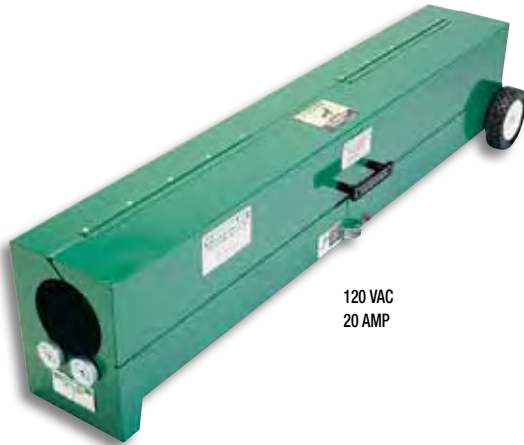
120 VAC 20 AMP