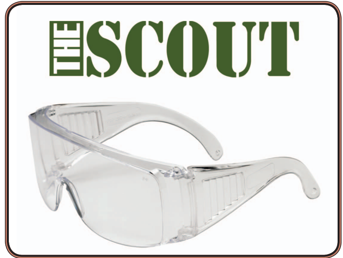
Polycarbonate lenses block 99.9% of the sun's ultraviolet rays. This ultraviolet protection has already been incorporated within the lens material when the lenses are being produced.

Country of Origin/Harmonization Code: Taiwan/9004.90.0000