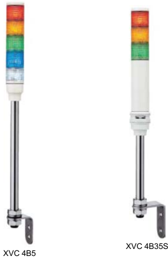
Table 19.367: XVC4 Tower Lights — 40 mm diameter (1.5 inches)