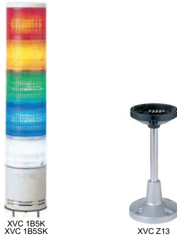
Table 19.369: XVC Tower Lights — 100 mm diameter (4 inches)