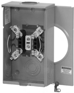
100 Ampere Single-Position Meter Socket (1007665CH)