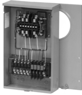
Instrument Rated Meter Socket 13 Terminal (USTH131A123CH)