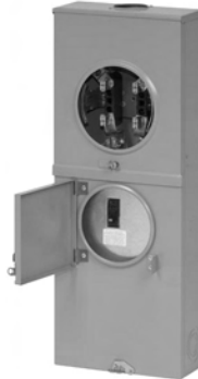
200 Ampere Single-Position Meter Socket (1009581CH)