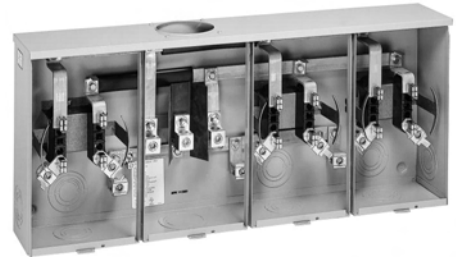
200 Ampere Multi-Position Meter Socket (1008960CH)