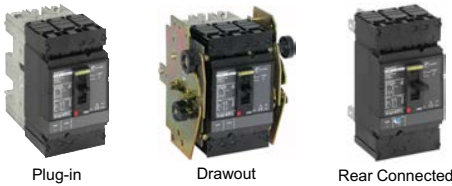
Table 7.56: H- and J-Frame Termination Options