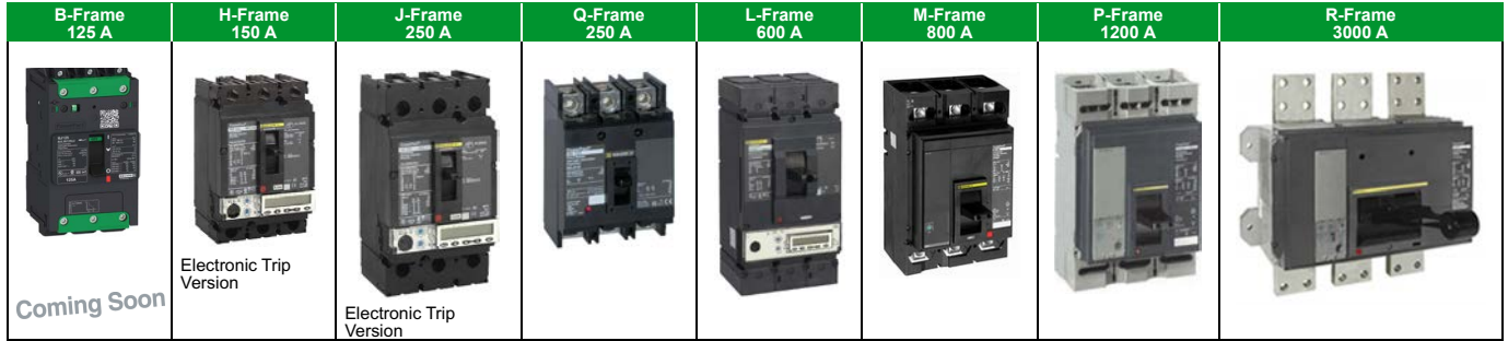
Table 7.47: PowerPact Interrupting Ratings