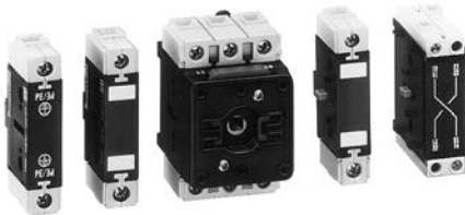
Add-On Contact Module