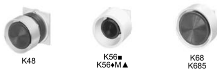
Table 19.293: Mushroom Button Guards