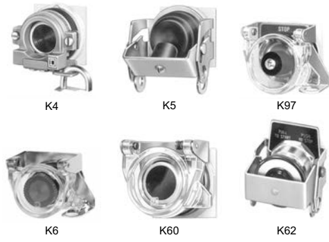
Table 19.291: Padlock Attachments