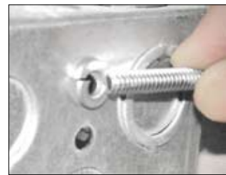
LW832 IN USE