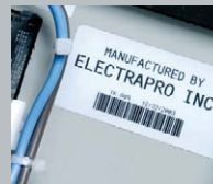
Industrial Barcode Labels