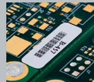
Circuit Board Labels