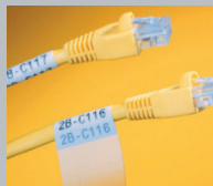
Voice & Data Communications