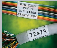
Wire & Cable Labeling