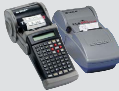
TLS 2200 ® / TLS PC Link ™ Thermal Label Printers See page 310