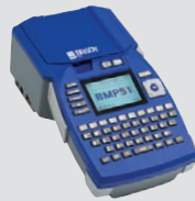
BMP ® 51 Label Printer See page 300