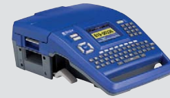
BMP ® 71 Label Printer See page 324