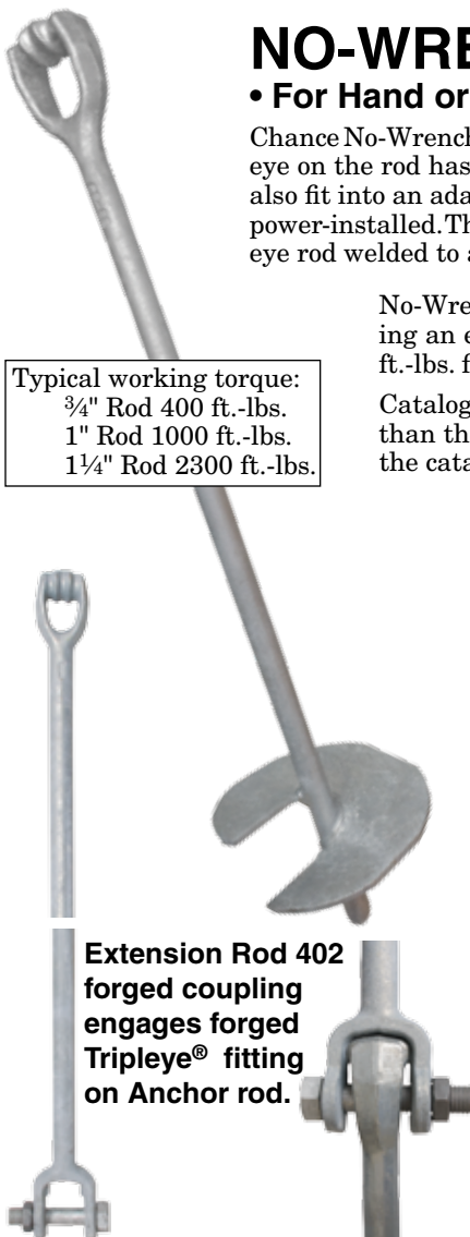
Extension Rod 402 forged coupling engages forged Tripleye ® fitting on Anchor rod.

Failure to install within 5° of alignment with the guy load will significantly lower strength.