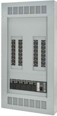
Table 9.97: RTI Cabled Lighting Section Kit for I-Line Combo Panelboard