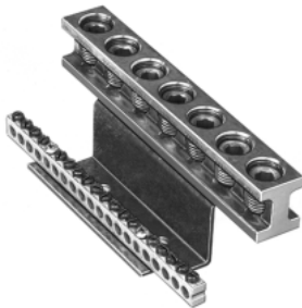
Equipment Ground Bar (Catalog No. PK32DGTA)