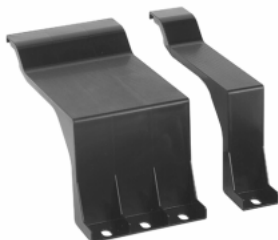
Blank Fillers (Catalog Nos. HNM4BL and HNM1BL)