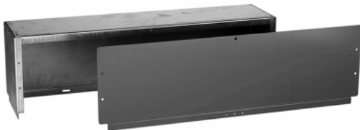
Typical Box Extensions