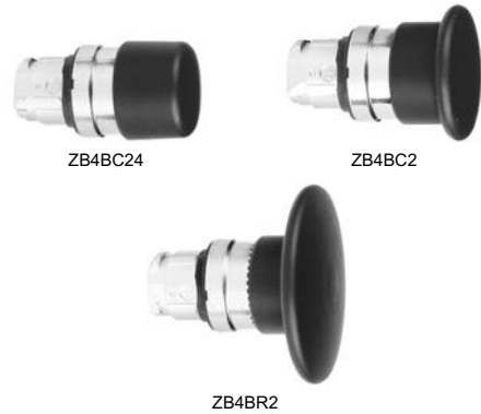
Table 19.77: Mushroom Heads, Momentary