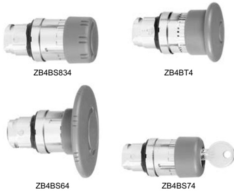
Table 19.78: Mushroom Heads for Maintained Push Buttons