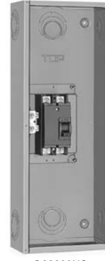
Q22200NS With Cover Removed