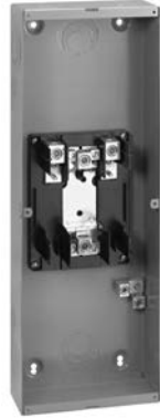
QOM22225NS With Cover Removed