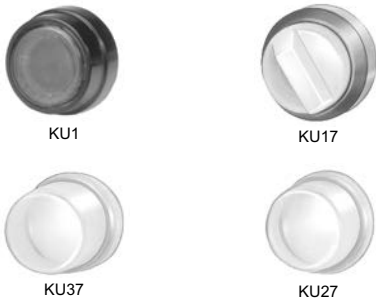
Table 19.294: Protective Boots