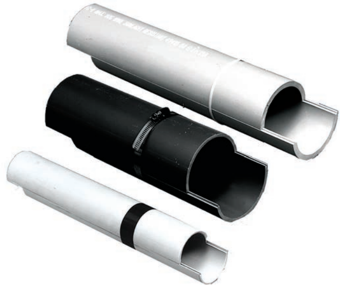
The fast and easy method of installing duct around existing cable for repair and temporary installations.

Verify with local inspection authorities before using.