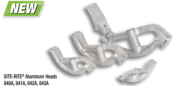
SITE-RITE® Aluminum Heads 840A, 841A, 842A, 843A