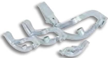
SITE-RITE® Iron Heads 840F, 841F, 842F, 843F