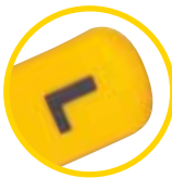
Smart-Grip™ Dual Durometer Molded