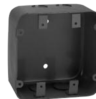
CR101X14 Combination Flush Plate and Box (Back)