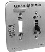
CR101X11 Enclosure Components