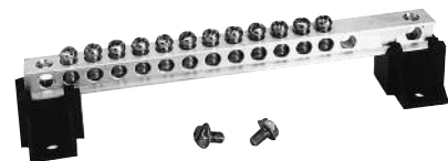
TGK12 with TGKIS