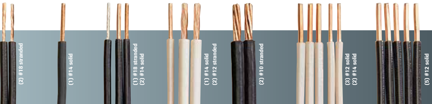
(2) #18 stranded (1) #14 solid (1) #18 stranded (2) #14 solid (1) #14 solid (2) #12 stranded (2) #10 stranded (3) #12 solid (2) #14 solid (5) #12 solid

The B2 B-CAP ® Wire Connector is the universal connector that accepts the widest range of wire combinations. Plus, the Classic Fin™ ergonomic design fits easily in tight electrical boxes.