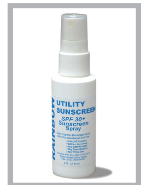
2-oz. Pump Bottle #40223