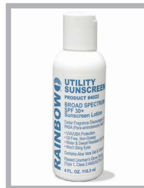
4-oz. Bottle #4022