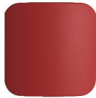
Locking Button Top View