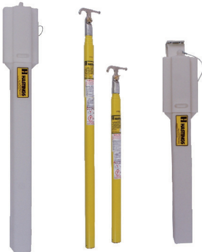
06-186 HV-312 HV-208 06-185