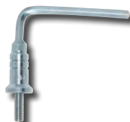
For hollow base materials