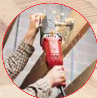
Hole drilling for conduit runs