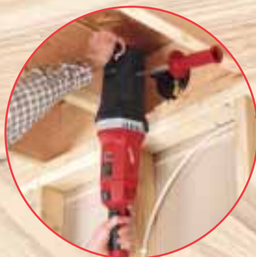
Hole drilling for HVAC venting