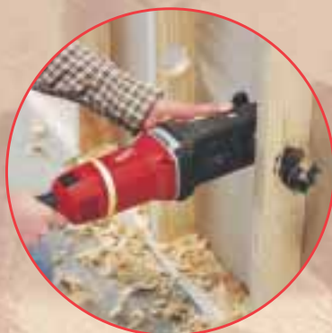
Hole drilling for piping runs