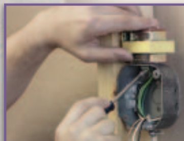
Lock-mount feature allows you to attach easily to electrical box.