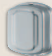
Door Buzzer LA201

60' of twin lead chime wire CL2X. 22 AWG.