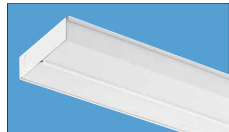
Example: UC 33 OP 120 CSW