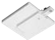
End Feed Connector and Outlet Box Cover