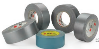
3M™ Duct Tapes are available in a variety of colors for color coding. A range of widths provides choices in coverage from 24mm to 22 inches.