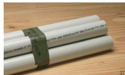
For bundling a wide variety of items, 3M™ Duct Tapes with natural rubber adhesive and high tensile strength backings adhere on contact and hold securely.