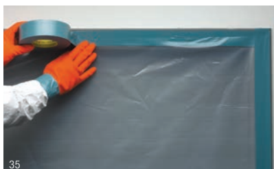
For a tight seal in many containment situations, 3M™ Performance Plus Duct Tape 8979 attaches heavy poly draping, closes cuffs, and then removes cleanly when the job is finished.