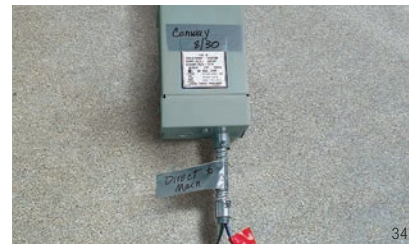
Write on the surfaces of many 3M™ Duct Tapes with pen or marker to leave a reminder or mark and identify works-in-progress, components, items bundled and more.