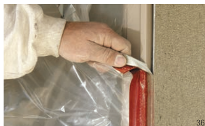
Strong backing of 3M™ Outdoor Masking and Stucco Tape 5959 pulls through stucco, EIFS and other heavy coatings in one piece.