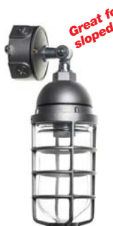
VA100DG shown in Natural