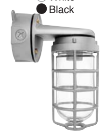
VXBR100DG shown in Natural