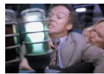
Best Supporting Prop in a movie! Here's a RAB Vaporproof in a scene from Ron Howard's "The Paper" starring Michael Keaton and Glenn Close. (When using outdoors, always install lamp base up.)