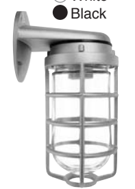
VBR100DG shown in Natural