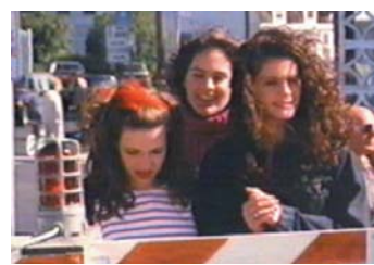
A VX100DG in a scene from the movie "Mystic Pizza" starring Julia Roberts. In Hollywood, they install fixtures upside down. You should always install fixture lamp base up.